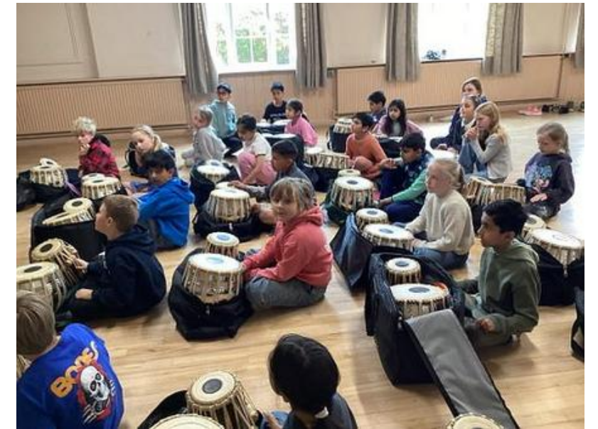
Class 3 and 4 have started their tabla drumming lessons!