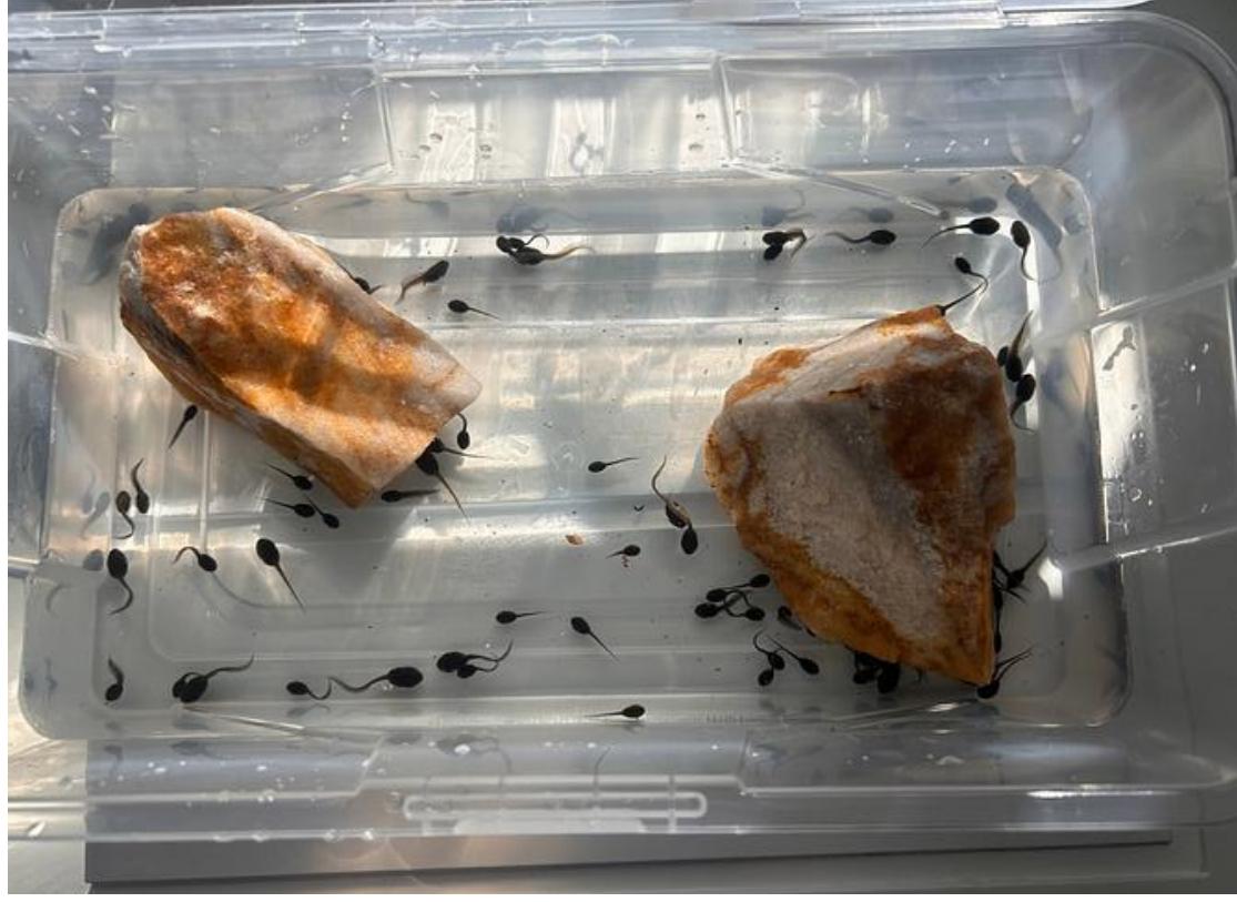
Class 1 have continued to look at the tadpoles!

Class 2 have been working with manipulatives in maths to help understand division.