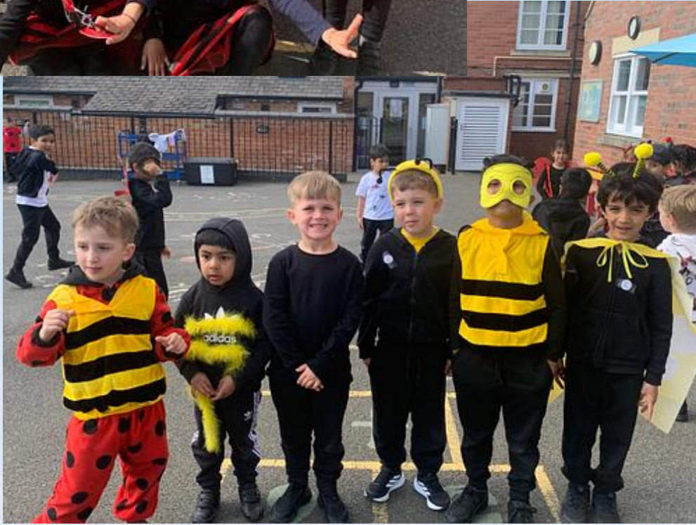
Class 1 and Pre-school's Ugly Bug Ball