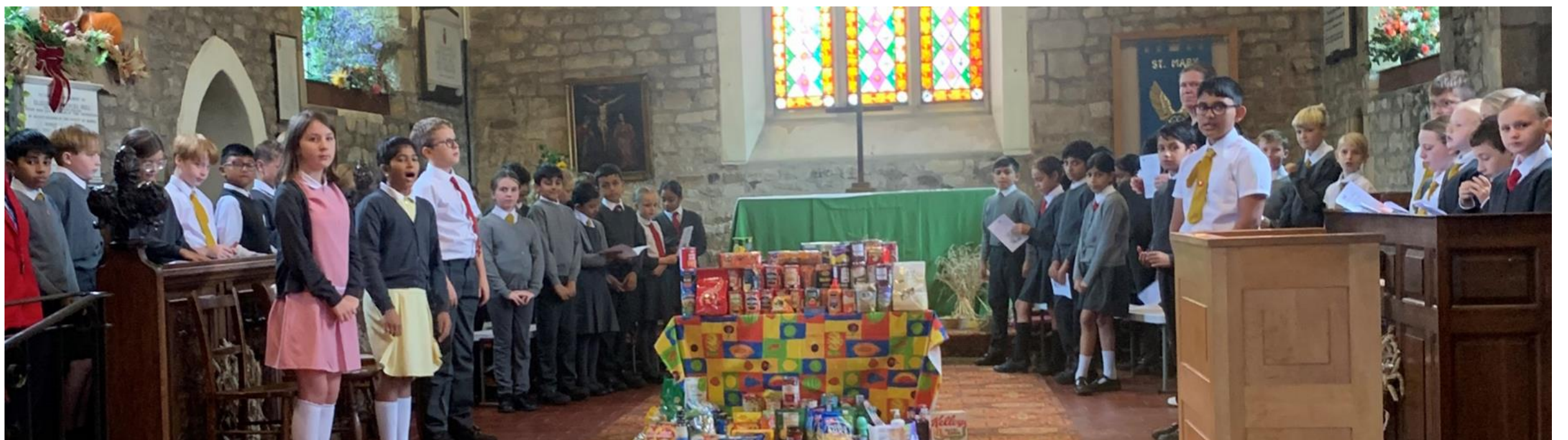
Big apologies to class 5. Their picture of them performing their poem has become corrupted.