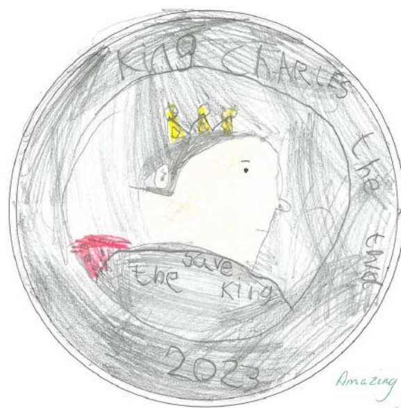
By Amari Class 1