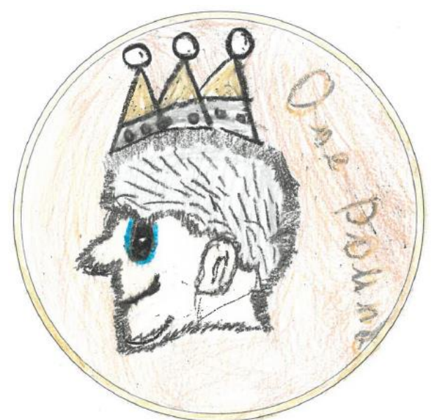
By Charlotte Class 2