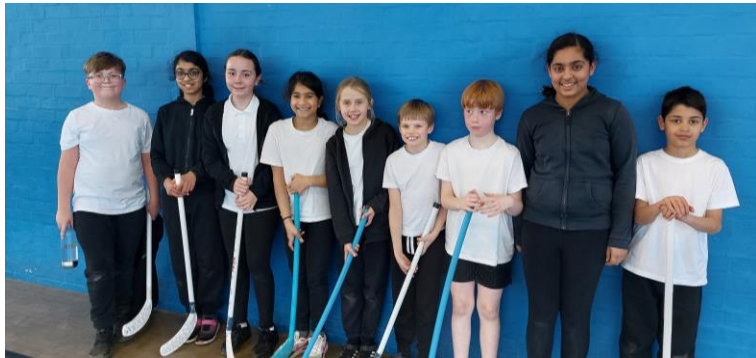
Viking Experience Day