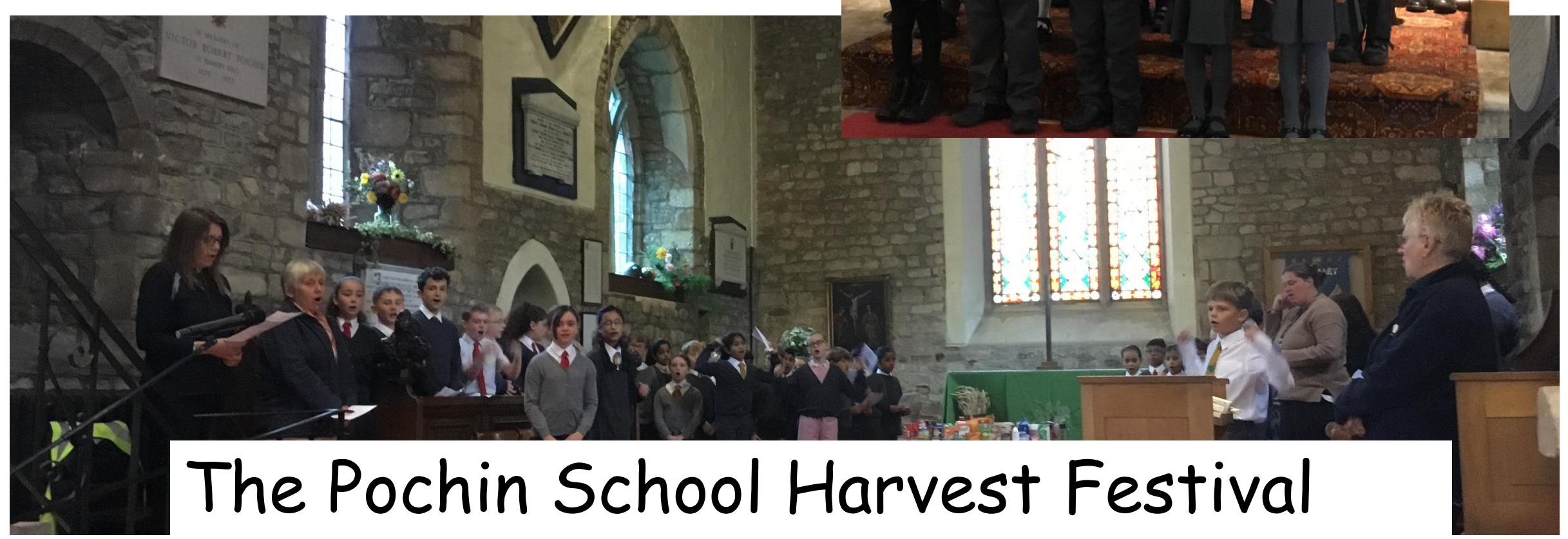
The Pochin School Harvest Festival