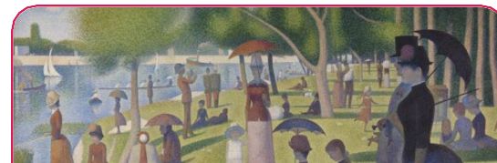
Georges-Pierre Seurat A French Post-impressionist artist.

Next step: developing children's understanding of photography as art and skills associated with this form of digital art.