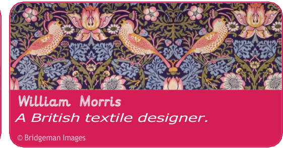
William Morris A British textile designer.