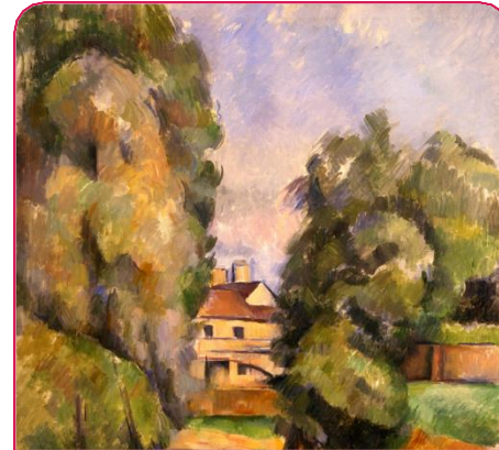
Paul Cezanne A French artist and Post-impressionist painter.

Title: Country House by the Water, c.1888