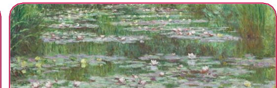
Claude Monet A French painter, and a founder of French Impressionist painting.