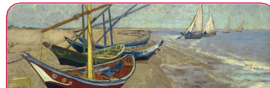
Vincent Van Gogh A Dutch painter and well-known Post-impressionist artist.