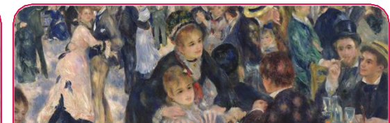
Auguste Renoir A French artist who lead in the development of the Impressionist style.