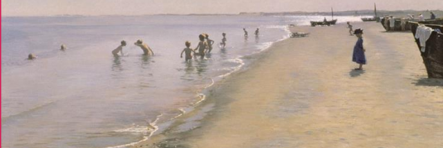
Peder Severin Kroyer