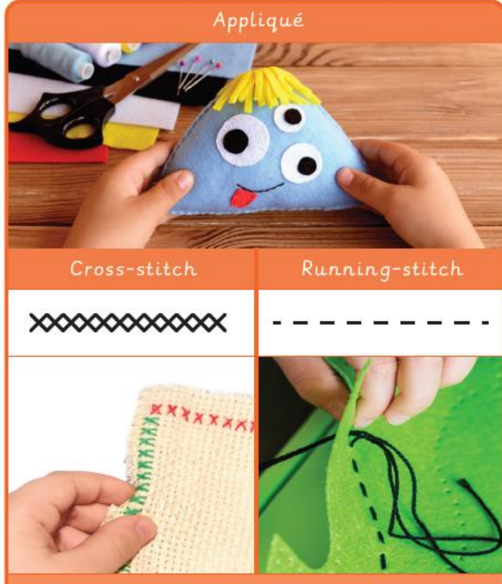
Remember to tie a knot in your thread so that the stitches stay secure and do not come undone!